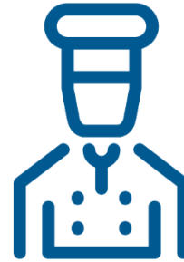
Technical, Vocational and Educational Training