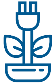
Energy and Environment