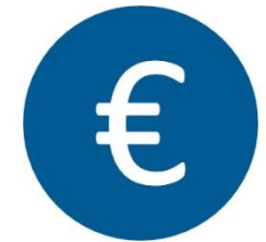
German Export Finance